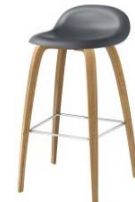
// Midnight Grey