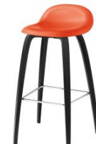
// Orange Sweet