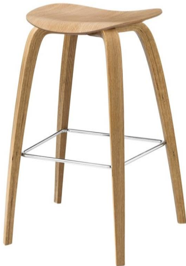
//Oak / Wood base