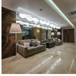
› MFC Capital City