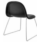
// Blackstained beech