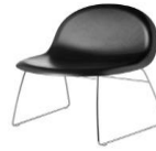
// Blackstained beech