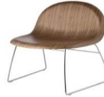
// American Walnut