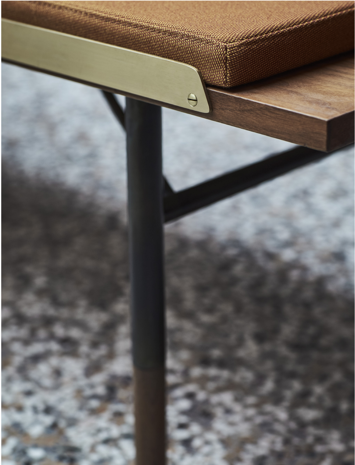
TABLE BENCH 1953 BY FINN JUHL —